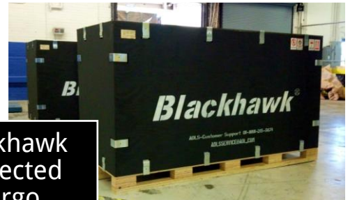
Blackhawk Protected Cargo