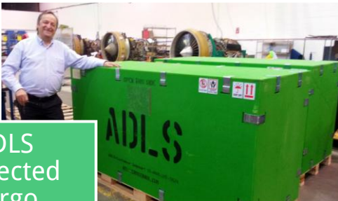
ADLS Protected Cargo

When damage does take place, ADLS's use of the Clear Spider inventory tracking system pinpoints where the damage occurred and documents the extent of the damage for review and insurance claims processes.